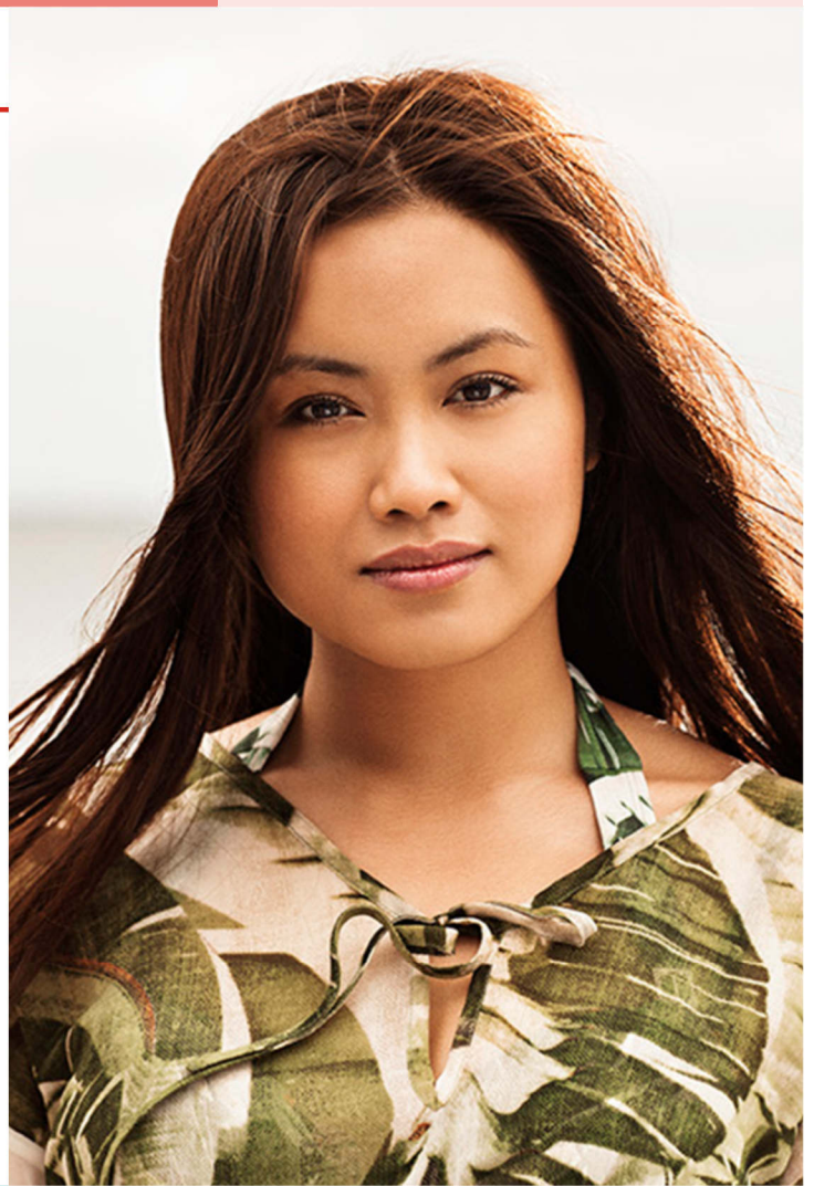
PAUSEÎLE™ A Retreat for stressed, dry and dull skin

GENENCARE® OSMS MI is ideal for all purpose skin care products as well as for colour cosmetics. Recommended use level: 0.5% - 1.0% . Globally approved ingredient, Ecocert and Cosmos compliant.